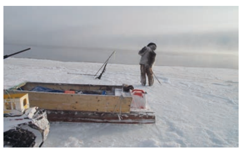
A hunter in Pangnirtung's program at the floe edge.

Lasalusie Ishulutaq demonstrating how to hunt seal to young people in Pangnirtung.