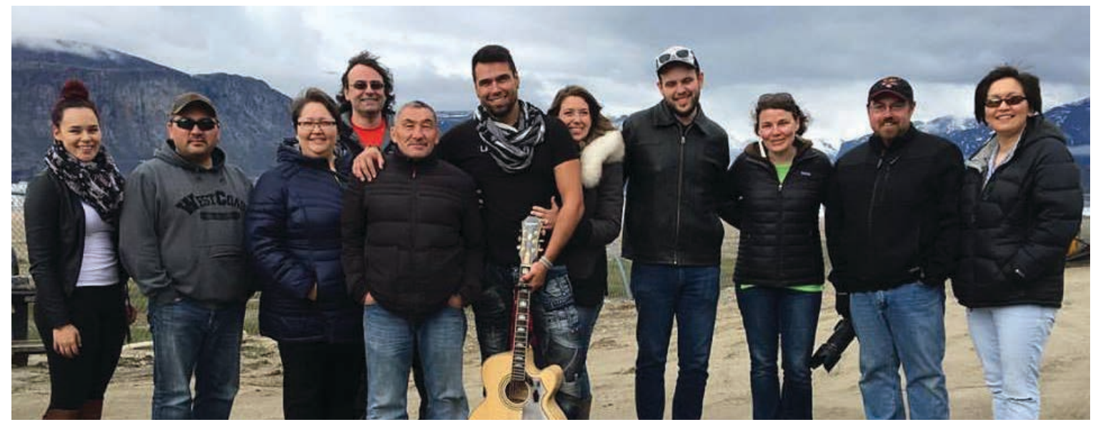
Twin Flames pose with the Pang Fest committee. The summer festival is a popular Pangnirtung music event financially supported by QIA. Organizers hope to make Pang Fest a regular annual happening.