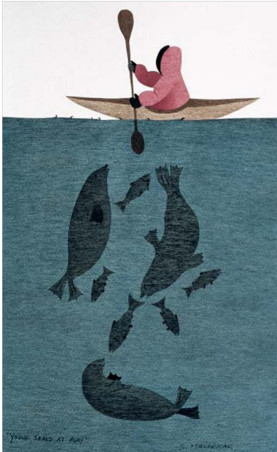
Susie Malgokak, "Young Seals at Play"