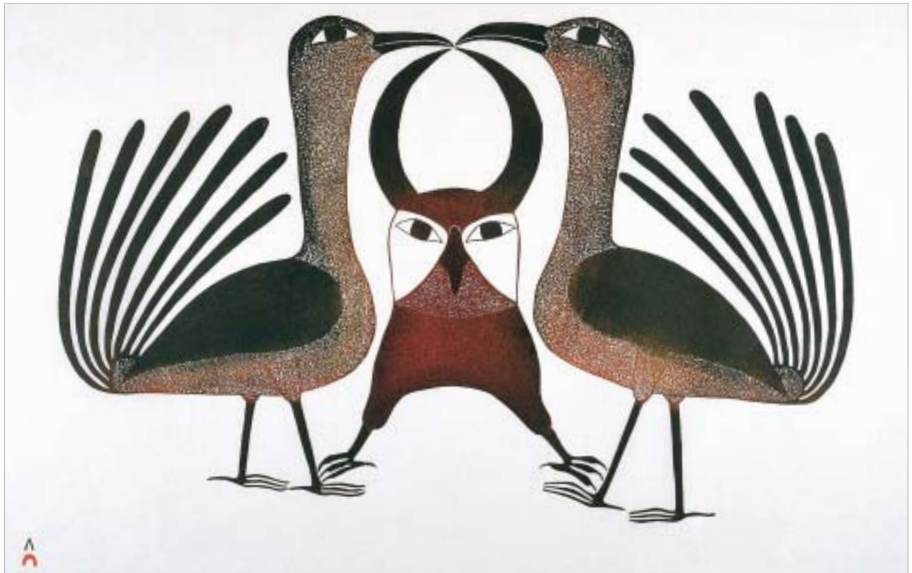
Kenojuak Ashevak, "Birds"