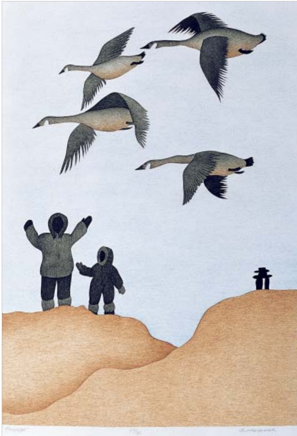
Susie Malgokak, "Good Bye"