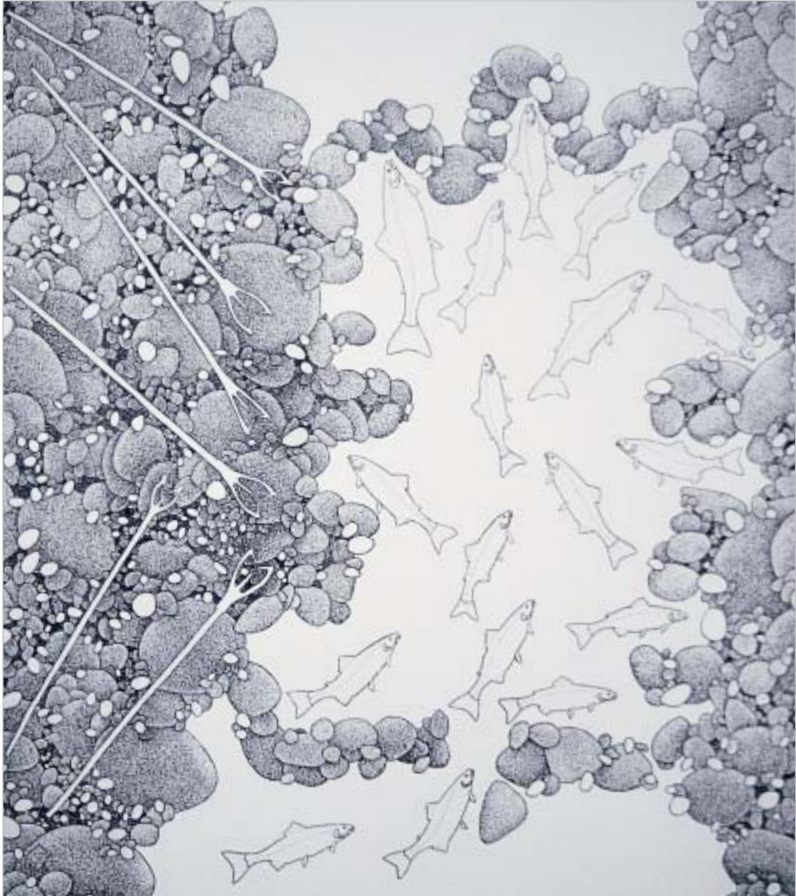
Germaine Arnaktauyok, "The Return"